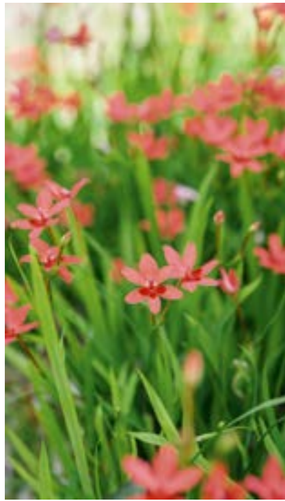
Papaver somniferum 'Lauren's Grape'

These big, sumptuous, silky bowls of deep purple are probably my favourite opium poppies. Designer Lauren Springer spent years removing all the opium poppies that weren't deep purple from her garden. When they have only themselves to cross with they come almost entirely true. Best sown in pots or in situ to avoid disturbing the root. If you want to grow more than one colour, you'll either have to remove all seedheads and sow fresh every year or resign yourself to the colours mixing and muddying back towards the wild, lavender opium poppy.