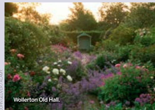
Wollerton Old Hall.

Wollerton Old Hall is four acres of intensively gardened heaven. The happiest of plants in the happiest of combinations. Each area with its own character, one magnificent display following another as the seasons change. Open 12pm-5pm Fridays, Sundays and Bank Holidays. Easter until August. Wollerton, Market Drayton, Shropshire TF9 3NA. Tel 01630 685760.