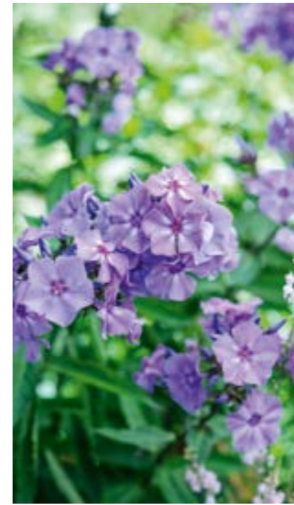
Phlox paniculata 'Blue Paradise'

By far and away my favourite phlox. On warm summer evenings its scent drifts across the garden, and at dusk its lavender-blue flowers seem to get bluer and bluer as the light slowly fades. They're almost purple at midday. Cutting back some of the stems by a third in May will extend blooming and make for sturdier plants. Selected by the great plantsman Piet Oudolf, it's remarkably mildew resistant. Divide your plants every three or four years to renew them.